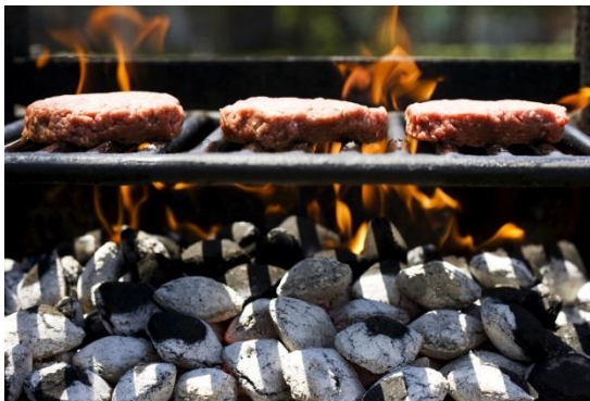
Solid fuel cooking

The ECOMIST exhaust hood with ecoaircurtain™ technology is a highly efficient kitchen ventilation hood designed specifically to be used over solid fuel cooking appliances such as charcoal grills and wood fired ovens. This hood uses ecomist™ spray-mist technology in conjunction with ecoshield™ baffle filters to mitigate the spreading of embers whilst efficiently filtering smoke and grease.