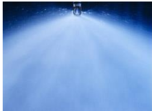
Wide angle water mist